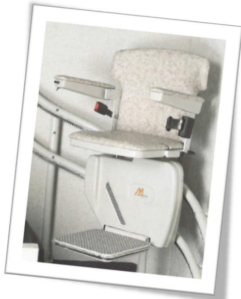
ABOVE Minivator 2000 Upholstery variations.

Handicare, who purchased Minivator, wishes to locate these stairlifts so that we may conduct the upgrade and remove the risk to anyone using the stairlift.