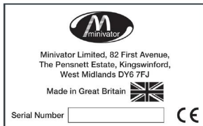
BELOW Serial number Label